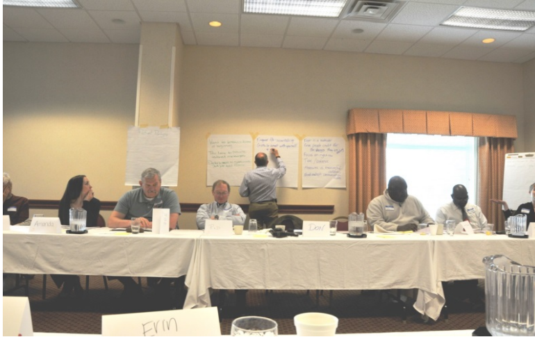
Participants in a “Boot Camp Translation” meeting as part of the Implementing Network’s Self-management Tools Through Engaging Patients and Practices (INSTTEPP) multi-PBRN project.