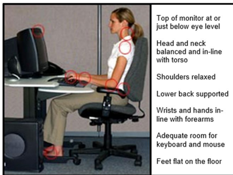
Figure 2. Computer Station e-Tool. 2

This following information is compiled from multiple sources. 1-4 In the figure below, there are several points listed on the sides. Let's break them down. Keep in mind you do many other things at work too, like answering phones, filing, etc. You might consider going to the Body Mapping Exercise at the Occupational Safety and Health Administration (OSHA) website for more information.