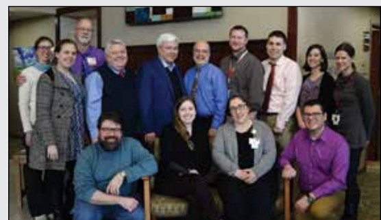
Madison and Baraboo faculty and residents at a recent RHET workshop

As part of its new Rural Health Equity Track, the Madison program launched a series of workshops to teach residents to “think globally and act rurally” in their current training and future practice.