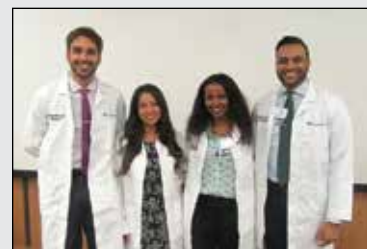
The first Lakeland RTT class

Last July, the Lakeland RTT welcomed its first class of residents. They have been working hard to grow the program, and the community is excited to have residents in the area. The program has since matched its second class, and will welcome those four new residents this summer.