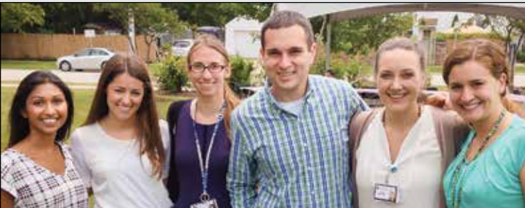
The first Waukesha class

Last July, the Waukesha program welcomed its first class of residents after transitioning to Aurora Health Care sponsorship and becoming an academic partner program. The program looks forward to welcoming its second class of residents this summer.